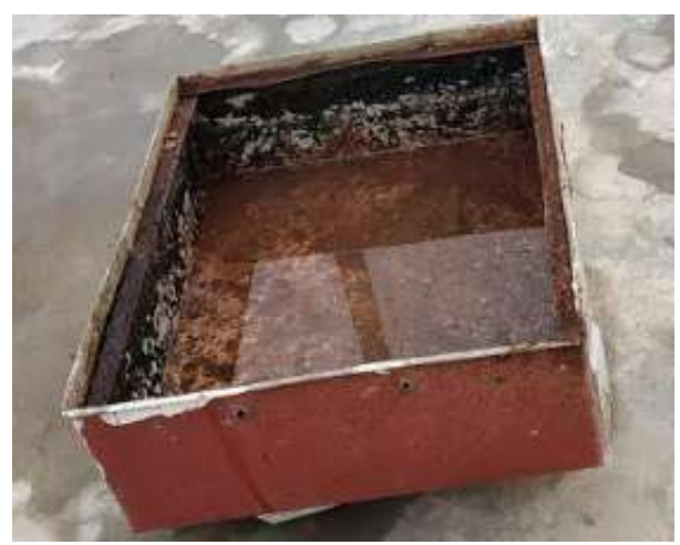
Fig. 3: Waste water inside the solar dryer