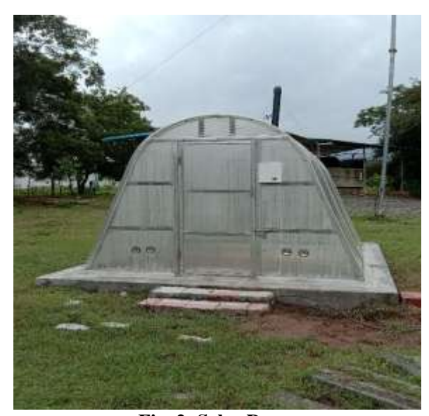
Fig. 2: Solar Dryer

The thermal behavior of the samples has been studied by TGA. The loss in weight of the material was analyzed. Normally the shape of the TG curve depends upon the nature of the situation of degradation reaction of the sample. The analysis of these data is often carried out with a view to estimate kinetic parameters like energy of activation of the degradation reaction. Figure 4 shows that there is a gradual decrease in sample weight with increase in temperature.