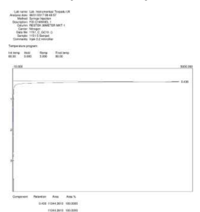
Figure 2: Bioethanol Chromatogram.

Gas Chromatography Detection: The ethanol standards for gas chromatography were 0.1%; 0.5%; 1% and 2%. The standards were injected to GC as much as 0.2 \ \mu L. Retention time of standard ethanol was 0.433 and 0.436. Same procedure was applied to the ethanol sample. The chromatogram showed that retention time of bioethanol was 0.436. The chromatogram can be seen at figure 2.